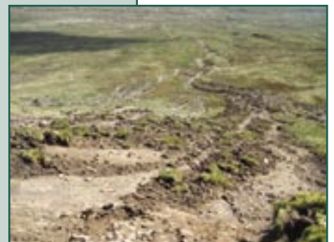
View Towards Caves

The Lessons Learned Group is a small group of professionals and enthusiasts in adventure activities, brought together by a common aim to incorporate any lessons that can be learned from accidents into ongoing good practice.