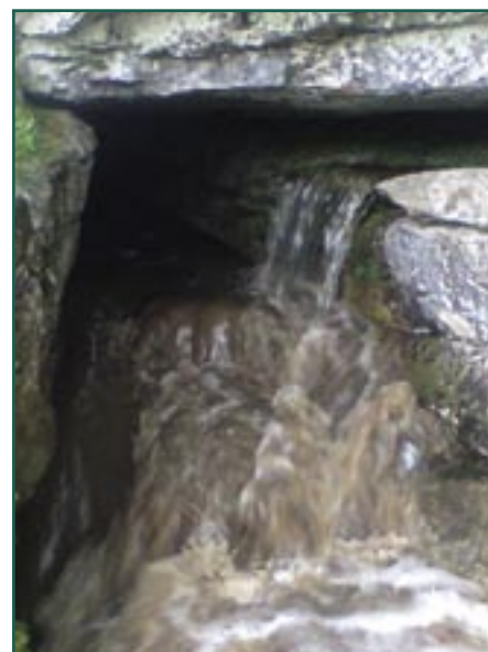
Middle Entrance Upstream

The Cave Rescue Organisation (CRO) had been called out to some walkers on the Ingleborough summit ridge who were scared by the severe thunderstorm and amount of water around them. These walkers were led off the hill. Rain hit the area around 14:45 hrs with some large hail and around 45 minutes of torrential rain. About 15:30 hrs a large number of surface streams and large land slips were visible in the catchment area of the Alum Pot and Long Churn cave systems. A pulse hit Dr Bannisters an hour after first rain, with peak cave at around 16:40 hrs. The Cave Rescue Organisation (CRO) was alerted that a minibus was still at the normal parking place (in dry conditions) and went up to the cave system to effect a rescue. They waited some time until the flood subsided before entering the cave and finding the group safe and well in the link passage.